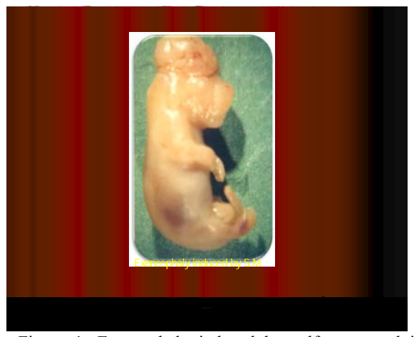
Figure 1. Exencephaly induced by sulfur mustard in mice