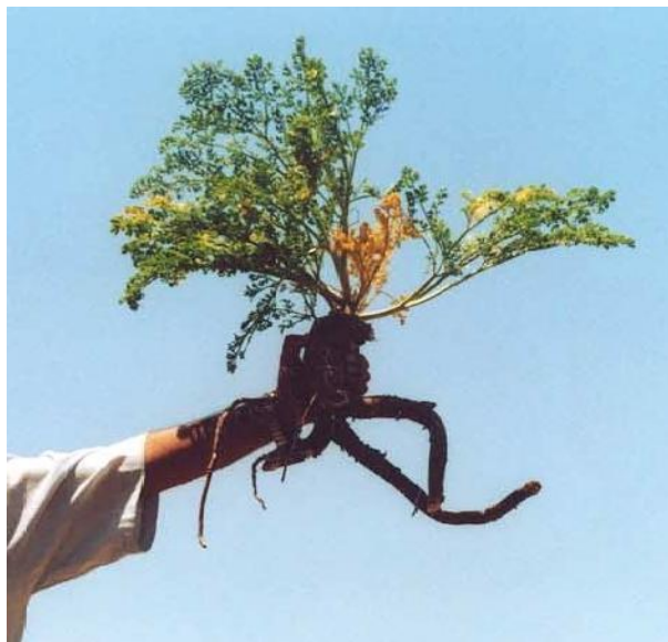
Figure 1. The plant Ferula persica

inflammatory and cancer chemopreventive), and galbanic acid (26) (anti-tumor and anti-angiogenic) have been reported from Ferula species.