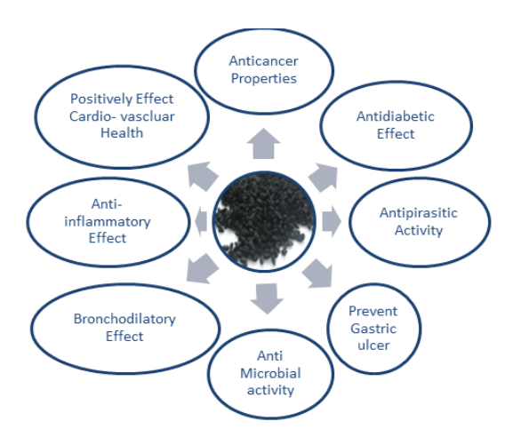
Figure 1. Health Benefits of the Nigella sativa

N. sativa seeds and it's oil, were traditionally used from centuries to cure various ailments in different parts of world particularly Asia, Middle East and Africa (18, 19). N. sativa holds special importance to Muslims as Prophet Muhammad once stated that "N. sativa can heal every disease except death" (20). N. sativa seeds are commonly used as spice and food preservative and are considered to have abortifacient, anodyne, anthelmintic, appetizing, carminative, deodorant, diaphoretic, digestive, diuretic, emmenagogue, expectorant, febrifuge, galactagogue and purgative effects (1, 21). In folk medicines it is used to treat conditions and diseases like asthma, bronchitis, cough,