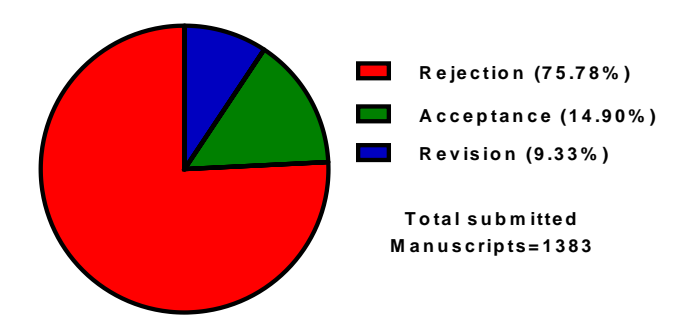
Figure 2. Overview of the percentages of submitted, rejected, and accepted manuscripts in 2020\,

The percentages of the number of submitted, rejected, and accepted manuscripts in 2020 are demonstrated in Figure 2.