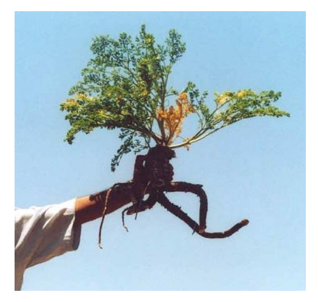
Figure 1. The plant Ferula persica

inflammatory and cancer chemopreventive), and galbanic acid (26) (anti-tumor and anti-angiogenic) have been reported from Ferula species.