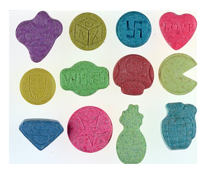
Figure 1. Examples of ecstasy tablets produced with various colours, geometric shapes and logos

which present an added danger to drug users. Ecstasy tablets are made and sold in various colours, with different geometric shapes and logos intended to make them more attractive to young people. The increased attractiveness of synthetic tablets leads to greater curiosity, which in turn leads to higher levels of addiction. Examples of recently captured ecstasy tablets are shown in Figure 1.